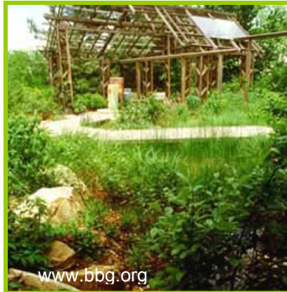
A rain garden built around an unusual gazebo

5. Use your imagination. You can make your rain garden a unique part of your yard, by using your runoff as a water feature, making it an unusual shape. Here are some examples of unusual rain garden ideas.