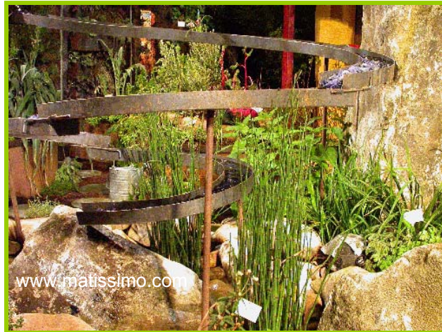
Neat water features, a fountain and a waterfall