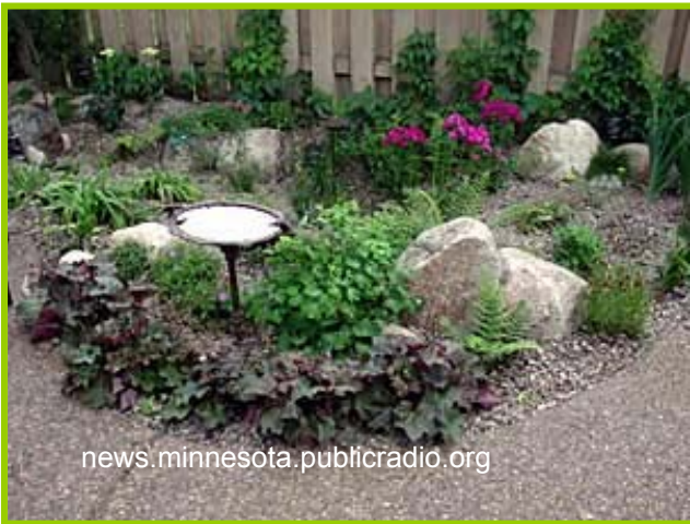
Stones and paths