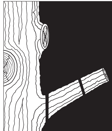
Proper pruning: A ring of callous (top) will form over a good vertical cut. First cut away the limb to remove the weight, making initial cuts from the bottom. Then cut the stub from below.

Under no circumstance should trees be topped. Not only does this prac-